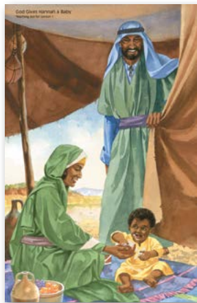
"God Gives Hannah a Baby" Teaching Aid 3

Eli told her, "Go in peace. May God give you what you have prayed for."