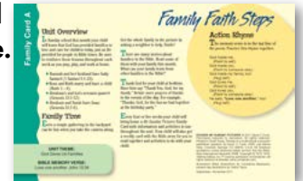
Family Card A

Make sure your students have their Make-It/Take-It picture of baby Samuel and My Sunday Pictures for Lesson 1.