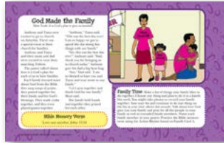
Lesson 1 (back)

The family held hands and together they prayed for each other.