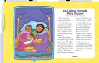
Lesson 1 (front)

Show children the Bible picture story on My Sunday Pictures . In today's Bible story, God gave baby Samuel to Hannah and Elkanah. God gave them