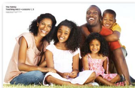
"The Family" Teaching Aid 2

I have a picture of a family that I would like to show you today. (Show the poster, Teaching Aid 2.) This family is enjoying the outdoors. Who do you see in the picture? (Dad, mom, sisters, brother.)